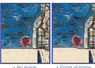
▲ No image stitching

Adopted with a high-standard optical image component, LS-4600 can capture an A0-size image by single lens, preventing occurring of errors for image stitching generated by dual