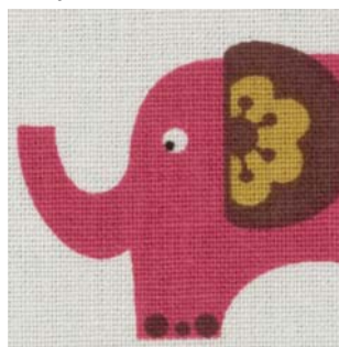
▶ Before applying with the Texture Smoothing function

This software is specifically designed for digital textiles and printings, offering many image improving functions, such as Texture Smoothing, Luminosity Sharpen and Detail Enhancement. ScanWizard DTG is good for using on printing digital patterns in textile, printing, dyeing and ready-to-wear industries.