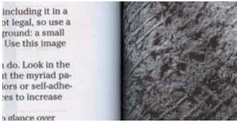
▶ Two-way LED light source Fewer shadows