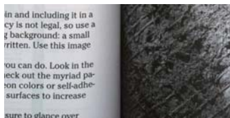
▶ One-way LED light source More shadows