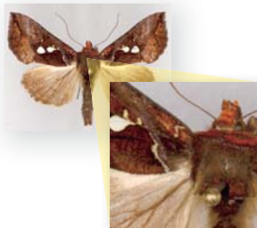
ObjectScan 1600H Images

The DOF (Depth of Field) of ObjectScan 1600H is up to +/- 6mm at 300 dpi. This is particularly suitable for specimens with raised or protruding areas, preserving the original appearance of specimens for academic research.